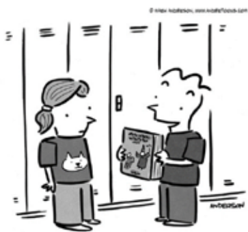
“You would not believe the battery life on this thing. I’ve been reading it for weeks!”

Claim your FREE copy today at www.servicesolutions.us/cybercrime